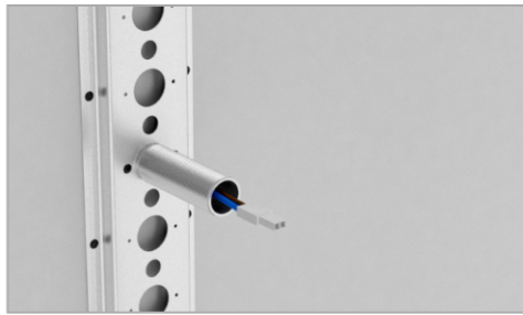
Electric connection cables can be run behind the mounting rail for simple connection.