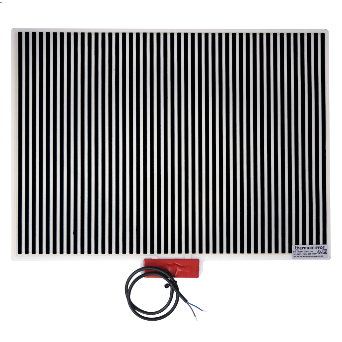
Note: All dimensions are in millimetres (mm)